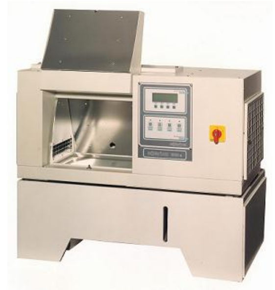
SOLARBOX 1500 E with FLOODING

PVC and corrosion-resistant materials ensure long life of this tank pump system: capacity up to 50 litres.